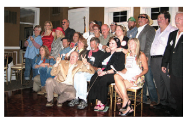
Left: These 16 lovely ladies came (in costume!) for "girls night out." Right: The entire cast of this year's murder mystery fundraiser poses for a group shot.