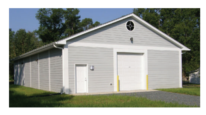
Collections Management Facility

Maybe one day someone will walk in with that one.