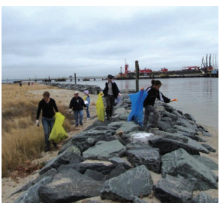
Volunteers pick up trash near the Piney Point Lighthouse (left) and comb the river's edge in search of trash and debris behind Piney Point Lighthouse.