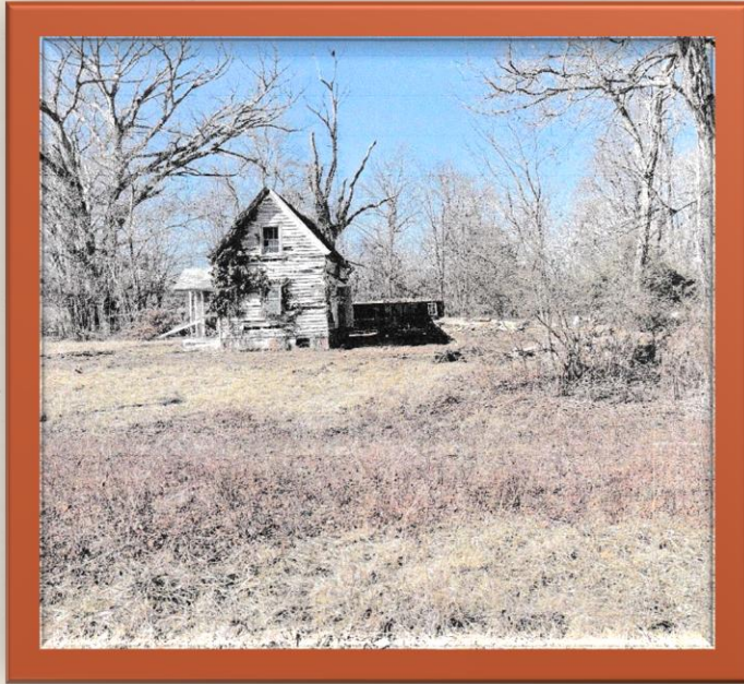
Tenant House Before Move